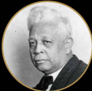
Oscar Stanton De Priest (1871-1951) politician and activist