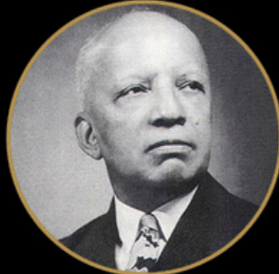
Carter G. Woodson (1875-1950) Father of Black History