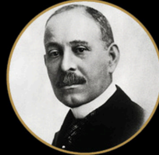
Dr. Daniel Hale Williams (1856-1931) open-heart surgeon