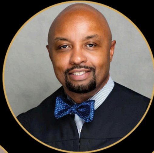
VINCENT F. CORNELIUS Circuit Judge of the 12th Judicial Court