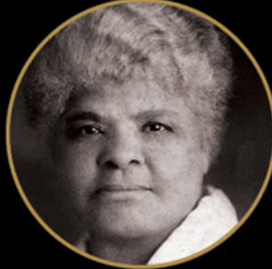
Ida B. Wells Barnett (1862-1931) journalist, educator, activist