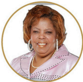
Shelia Allen-Stokes Catering and Decoration