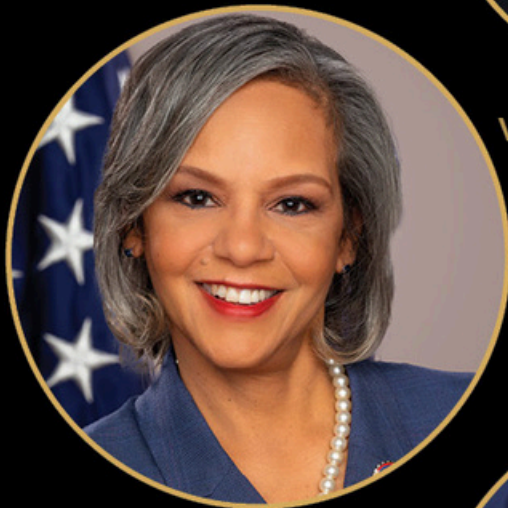
ROBIN KELLY US Representative IL-2nd District