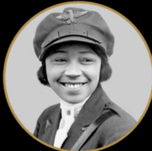
Bessie Coleman (1892-1926) civil aviator