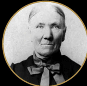
Sarah E. Goode (1855-1905) inventor and entrepreneur