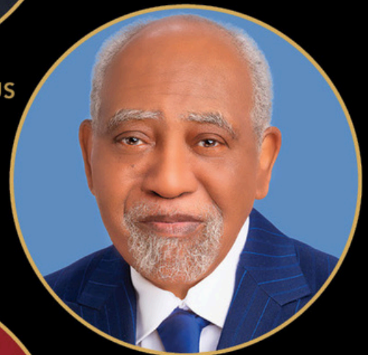
DANNY K. DAVIS US Representative IL-7th District