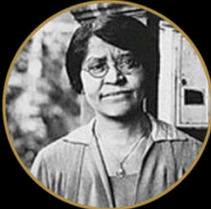
Annie Turnbo Malone (1869-1957) chemist and entrepreneur