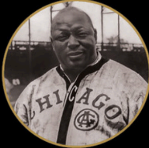
Andrew Rube Foster (1879-1930) Father of Black Baseball