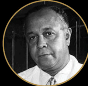
Percy Lavon Julian (1899-1975) research chemist