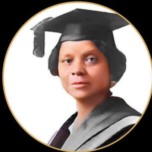
GEORGIANA ROSE SIMPSON (posthumously) First African-American PhD UChicago 1921