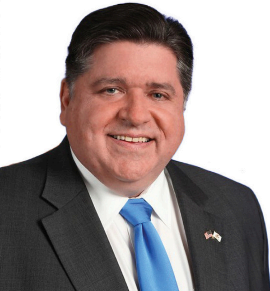
Governor JB Pritzker

A handwritten signature in black ink, appearing to read "JB Pritzker". The signature is stylized and written in a cursive-like font.