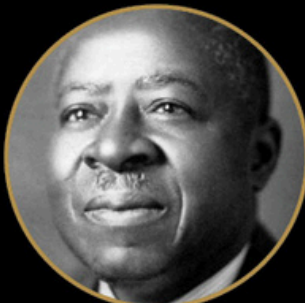
Robert Sengstacke Abbott (1868-1940) journalist and media mogul