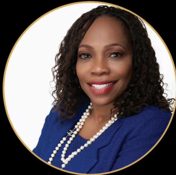
SHEILA CHALMERS-CURRIN Mayor, Village of Matteson, IL