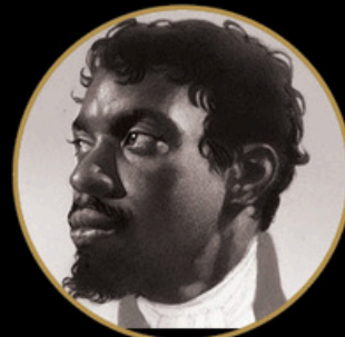
Jean Baptiste DuSable (1748-1818) founder of Chicago